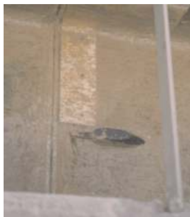
Foul-resistant velocity sensor due to stream optimized construction