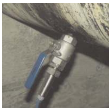
Flow measurement in discharge pipes Interruption-free assembling of the measurement device